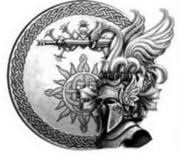
Plate armor (4) Large shield (1)