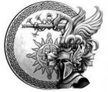
Plate armor (4)